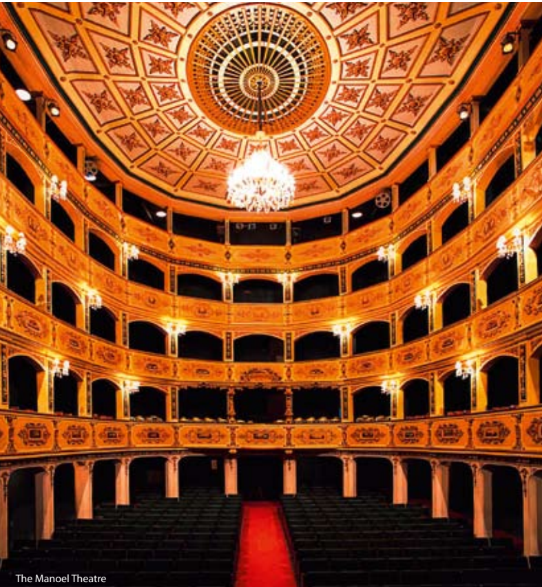
The Manoel Theatre

This event celebrates the essence of Valletta - culture, entertainment and shopping, by means of a variety of events and initiatives around the capital city. www.visitmalta.com/events