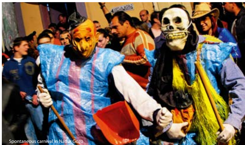
Spontaneous carnival in Nadur, Gozo