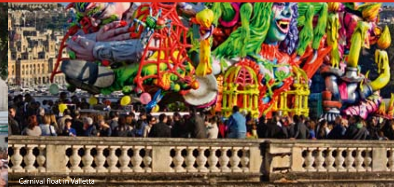
Carnival float in Valletta