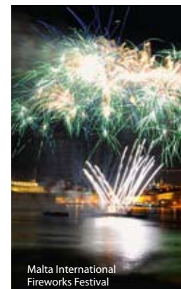
Malta International Fireworks Festival

The 9th Edition of the Malta International Fireworks Festival will be organised once again in and around the majestic Grand Harbour-the perfect setting for this event. The Festival will take place on the 29th and 30th of April 2010. On the 24th of April the 4th Mechanical Ground Fireworks Display will take place on the granaries (il-Fosos) in Floriana. www.visitmalta.com/events