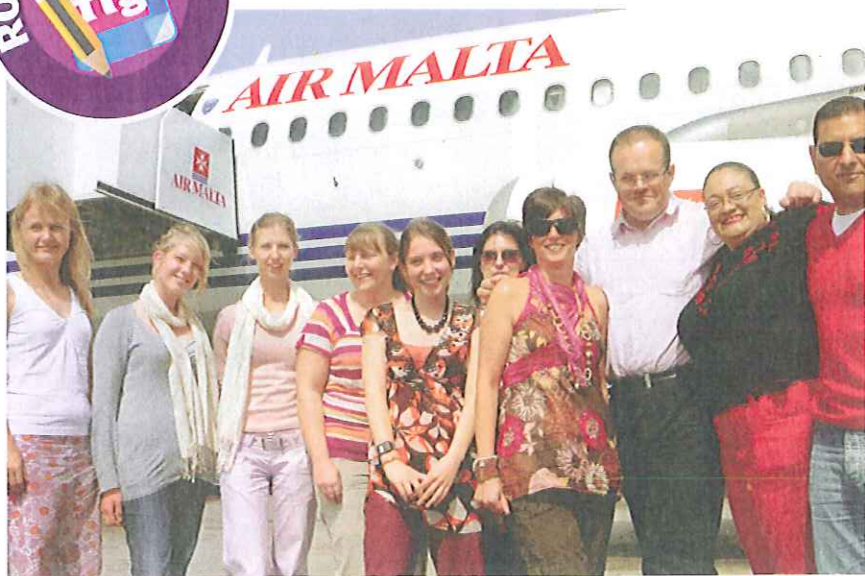
The Way To Gozo fam trip was sponsored by Malta Tourism Authority, Air Malta and Kempinski Hotel San Lawrenz