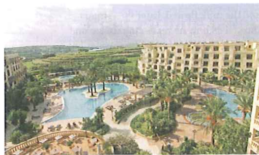
Kempinski Hotel San Lawrenz

The hotel grows its own fruit, vegetables and herbs for use in its restaurants.