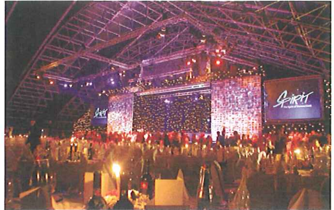
2,000 Thomas Cook sales managers enjoyed the island