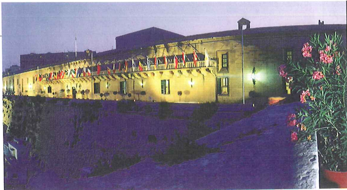
The Mediterranean Conference Centre in Valletta